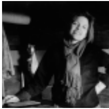
MARIE WATT: A BLANKETED SPACE