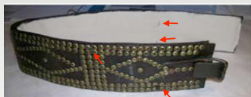
Mount stitched to belt with artificial sinew in 4 locations

There are only four holes in the belt that can be used to attach the mount, and the tongue is torn and abraded. A semi-rigid mount is created from one side of a sheet of Corex™ that is encased in a twill tape sleeve. One end of the mount extends beyond the end of the belt, and Velcro is sewn to the outside face. Velcro is sewn to the inside face of the opposite end of the belt. A slit is made in the extension for the original tongue.