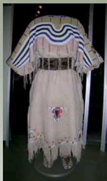
Blackfeet Dress 13/2381, Belt 17/9666

SOLUTION: Belt mounts are stitched in place through existing holes in the belts. Tyvek™ strips with Velcro™ closures stabilize belts on mounts. Velcro sewn to inside of belt mount attaches to Velcro on twill tape.