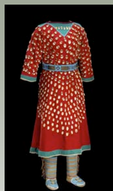
Crow Dress 12/6406, Belt 21/6853

PROBLEM: Belt leather is cracked and inflexible. Cracked areas on belt require support. Belts need to conform to shape of mannequin.