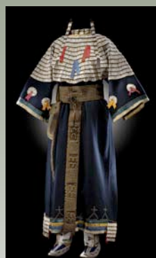
Sioux Dress 02/6425, Belt 21/1916