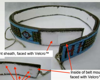
Mount sheath, faced with Velcro™

The belt is pieced together in two locations with sinew stitches, and the stitches and leather are worn and fragile and require support. There are only holes through the belt at one end. Mount is made from Plastazote™ encased in Tyvek™; the belt is inserted into a sheath sewn in one end of mount and stitched through existing holes into the other end of mount.